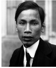
Figure 1. Ho Chi Minh, as a delegate to the French Communist Party Congress in Marseilles, 1921.

In 1922, while campaigning for Vietnam's independence struggle in France, Ho published what may have been his first article on anti-Black racism, in the French communist anti-colonial newspaper Le Paria , which Ho himself established. In this article, "About Siki," Ho examined the career of Louis Mbarick Fall – known as Battling Siki – a Senegalese boxer who had moved to France at the age of fifteen. Siki had recently defeated the White French boxer Georges Carpentier in Paris to become world middleweight champion. Ho insisted that Siki's victory over Carpentier was no loss for France, since Siki was also a Frenchman. He then criticized the racist double standards in the news coverage of the respective boxers. Pundits attributed Carpentier's victories to his skill and intelligence, but when Siki beat him, the same pundits blamed Siki's allegedly dirty tactics, and refused to acknowledge Siki's victory. Ho was disgusted by this unequal treatment 4 (Figure 1).